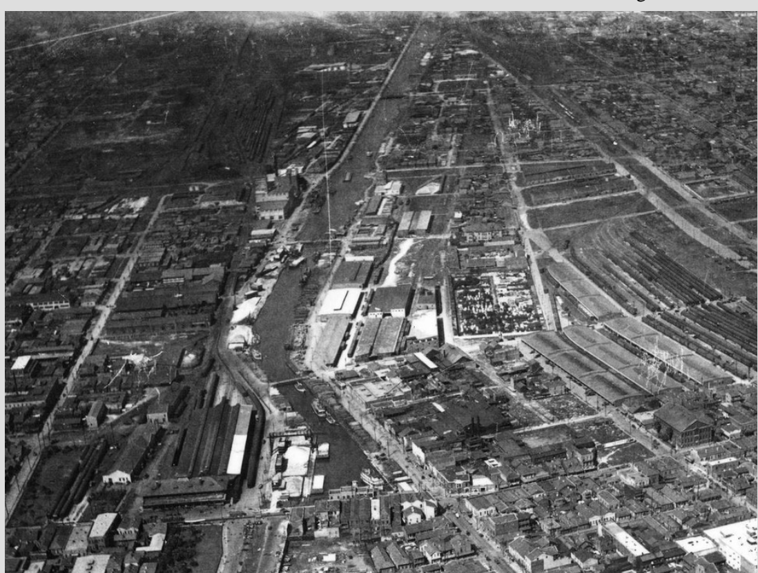
Above: 1922 aerial photo of New Basin Canal turning basin area.

What spelled the end of the New Basin Canal were trucks, modern highways, the Industrial Canal and Intracoastal Waterway. These 20<sup>th</sup>-century conveyances enabled more cargo to flow more efficiently from broader hinterlands, while the canals of the 18<sup>th</sup> and 19<sup>th</sup> centuries came to be seen as traffic obstacles and neighborhood nuisances.