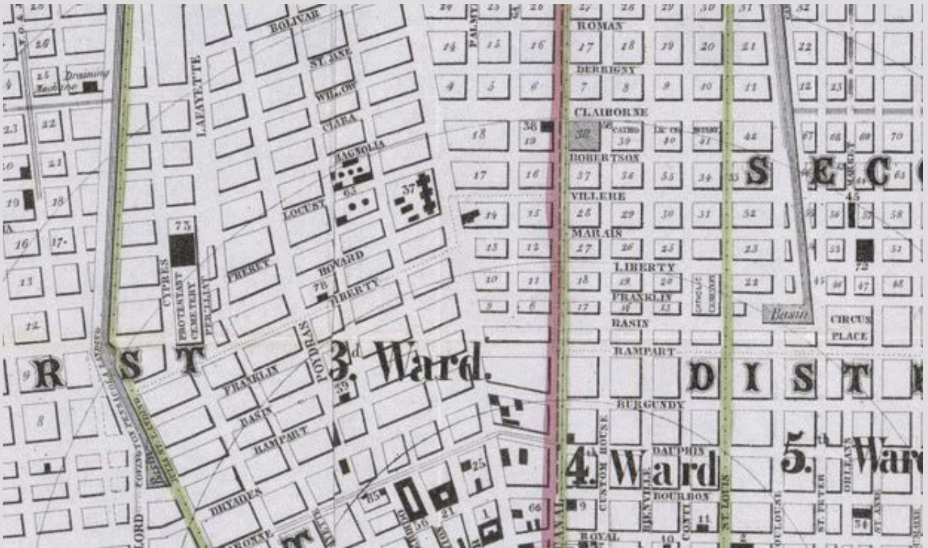
This detail of the 1854 Norman Map of New Orleans shows the New Basin Canal turning basin, at left, and the Old Basin, at right.

Yet another group of investors eyed Lake Pontchartrain and bristled as its resources mostly flowed downtown, to the more Creole half of the metropolis. Wanting a piece of the action for uptown, these Anglo-American financiers formed an "improvement bank"—that is, a corporation aimed at building private infrastructure, as opposed to a commercial bank (for merchants) or a property bank (for mortgages). This was an era when the federal government was too weak to build much transportation infrastructure throughout the growing nation, so the task often fell to the private sector.