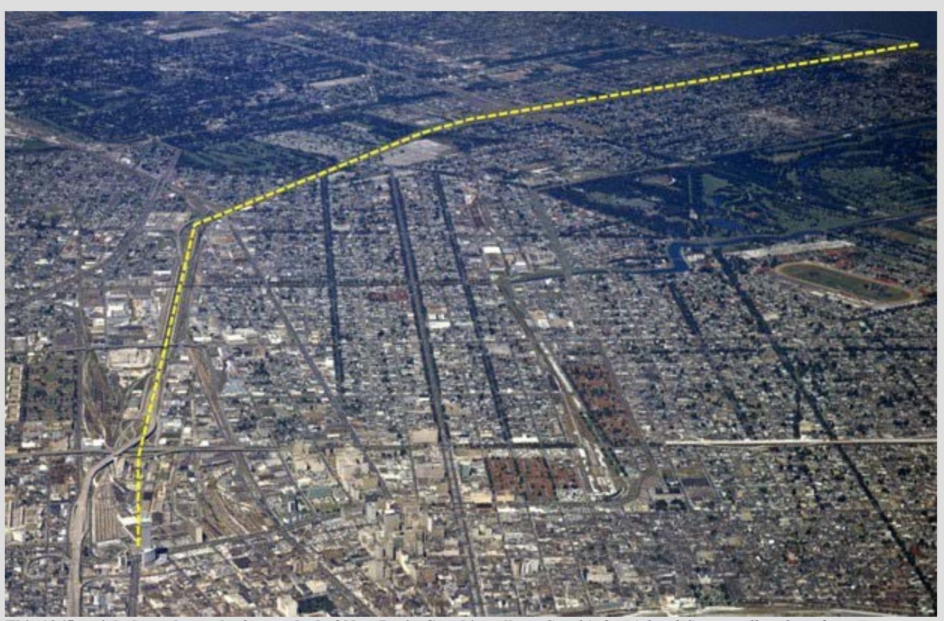
This 1965 aerial photo shows the former bed of New Basin Canal in yellow. Graphic by Richard Campanella

Land acquisition was critical not only for rights-of-way and investor confidence, but also because the canal would raise the value of adjacent lots—and now was the time to scoop them up. Indeed, the company began "flipping" parcels as early as 1832, before digging even began, and profited four-fold from their resale, using the revenue to pay investor dividends.